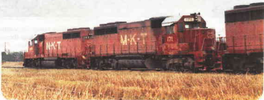
TOP - A wintry day in February 1985 at Union Station in Little Rock, Arkansas shows two Missouri Pacific freights passing, one northbound and one southbound (the one with the red caboose). BOTTOM - Red MKT units (nos. 171 and 203) compass eastbound (toward Houston) through New Ulm, Texas in March of 1974.