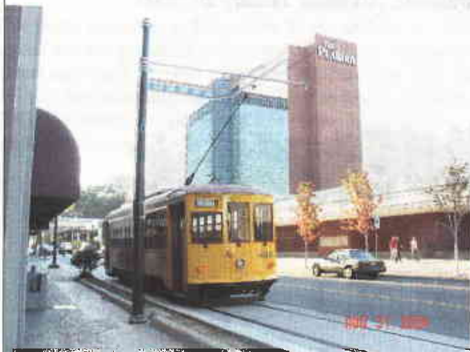
Streetcar No. 409 on a test run August 31, 2004 on Markham Street in Little Rock. The Peabody (right) and Capitol Hotels (left) are visible.

I'm rambling, I guess. But I love streetcars and have ridden them in many cities. Memphis had a stellar line that went to Overton Park. Philadelphia, San Francisco, and New Orleans still have successful streetcar lines. Greater Little Rock could have one too with foresight and enthusiasm. Think what an attraction it would be.