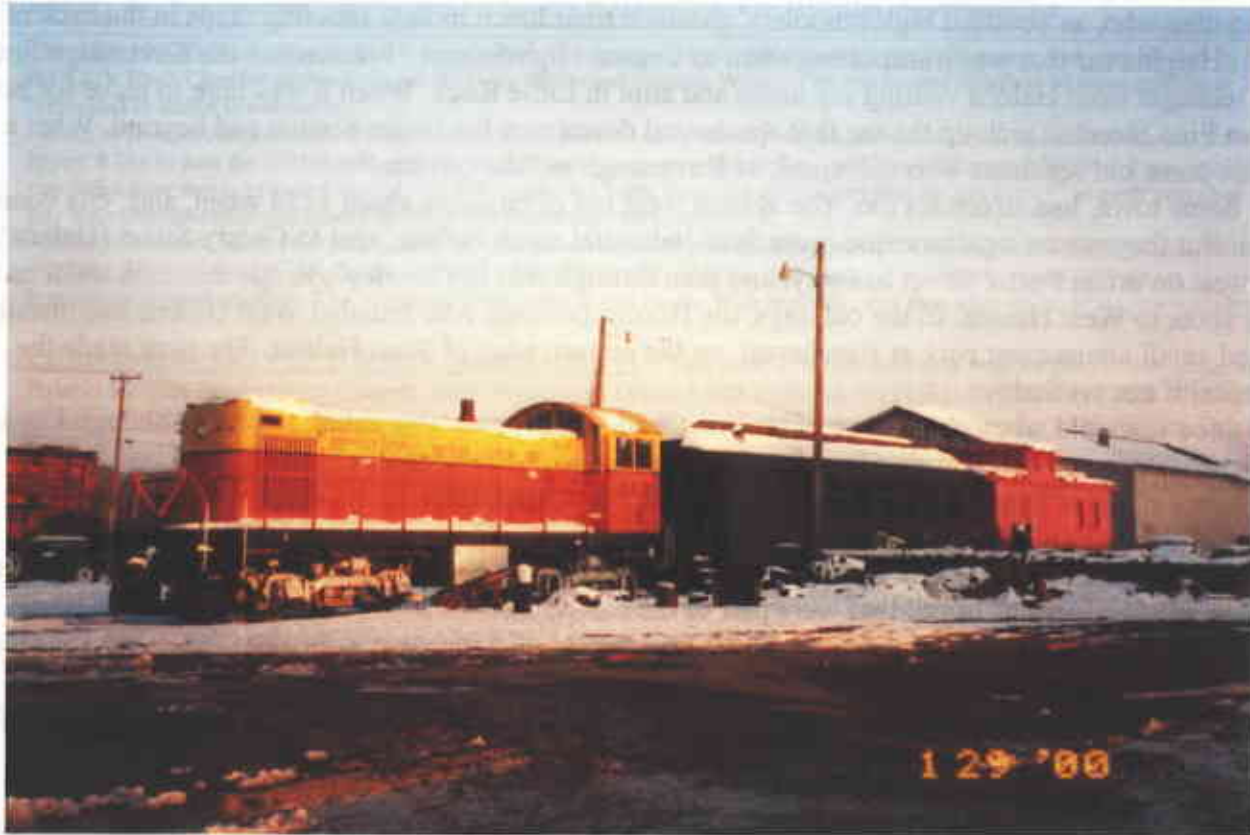
Dardanelle & Russellville snow-covered train in North Dardanelle, Arkansas, January 29, 2000. Locomotive is D&R No. 18.