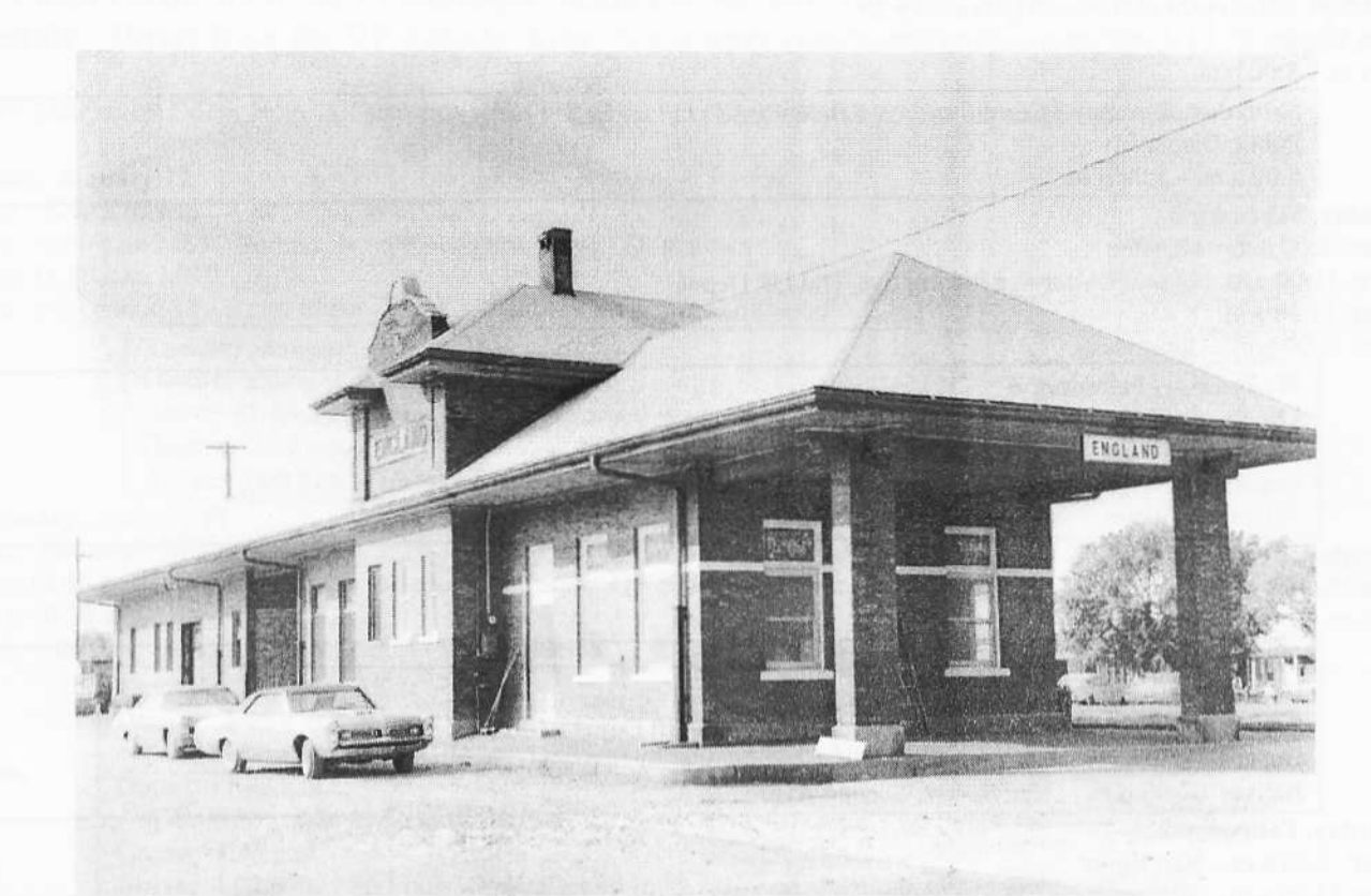
Cotton Belt's England, Arkansas depot, 4 September 1967