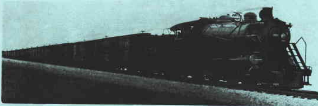
EARLY PHOTO OF COTTON BELT "BLUE STREAK" PULLED BY 4-6-0 PASSENGER LOCO NO. 659.