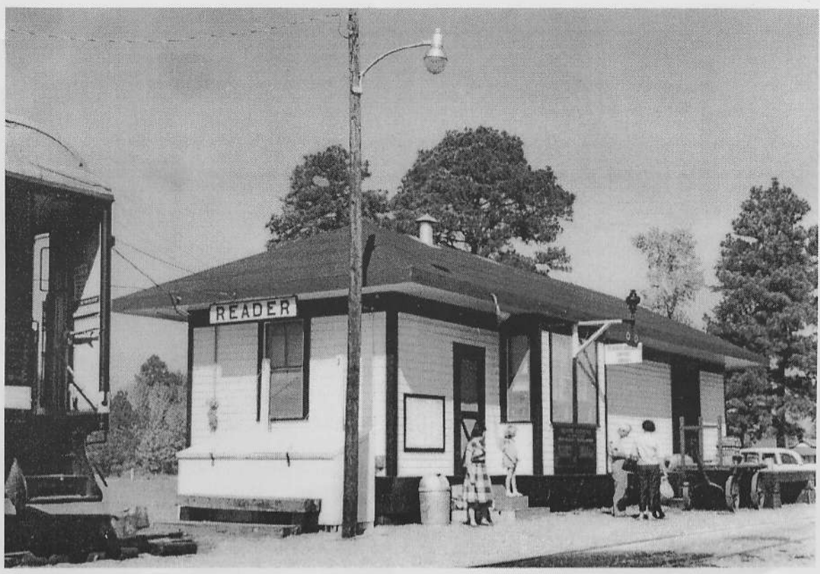
Reader, Arkansas Reader Railroad depot, 1963.