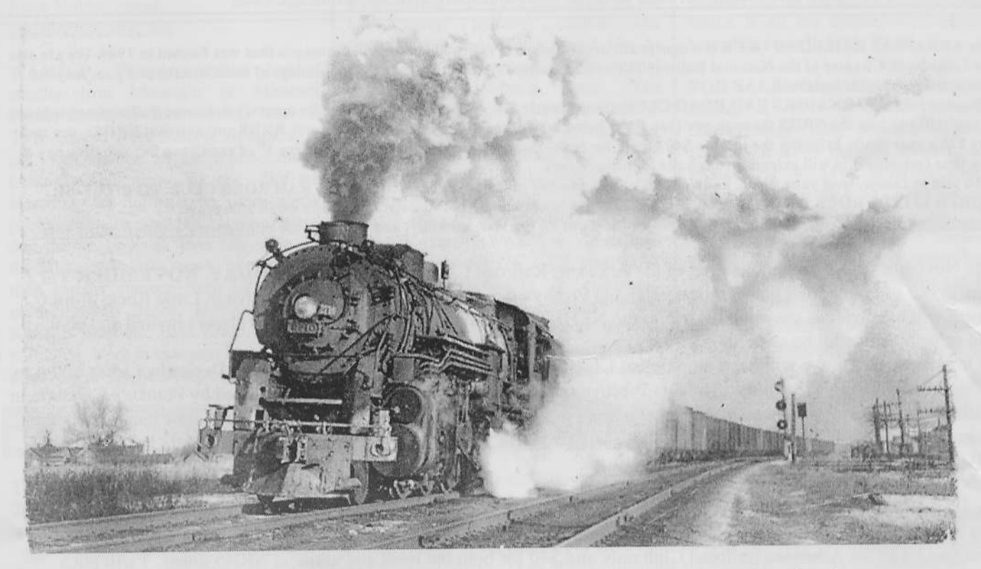
CNW #2710 rushing through East Moline, Illinois on January 7, 1951.