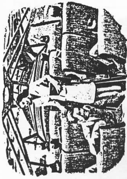
Astra Dome of Chair Car—deep-cushioned comfort, a matchless view.