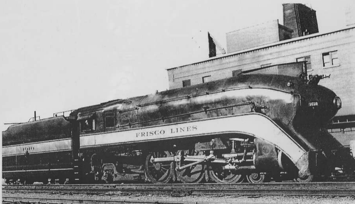
Frisco 4-6-2 #1018, date, location and photographer unknown.