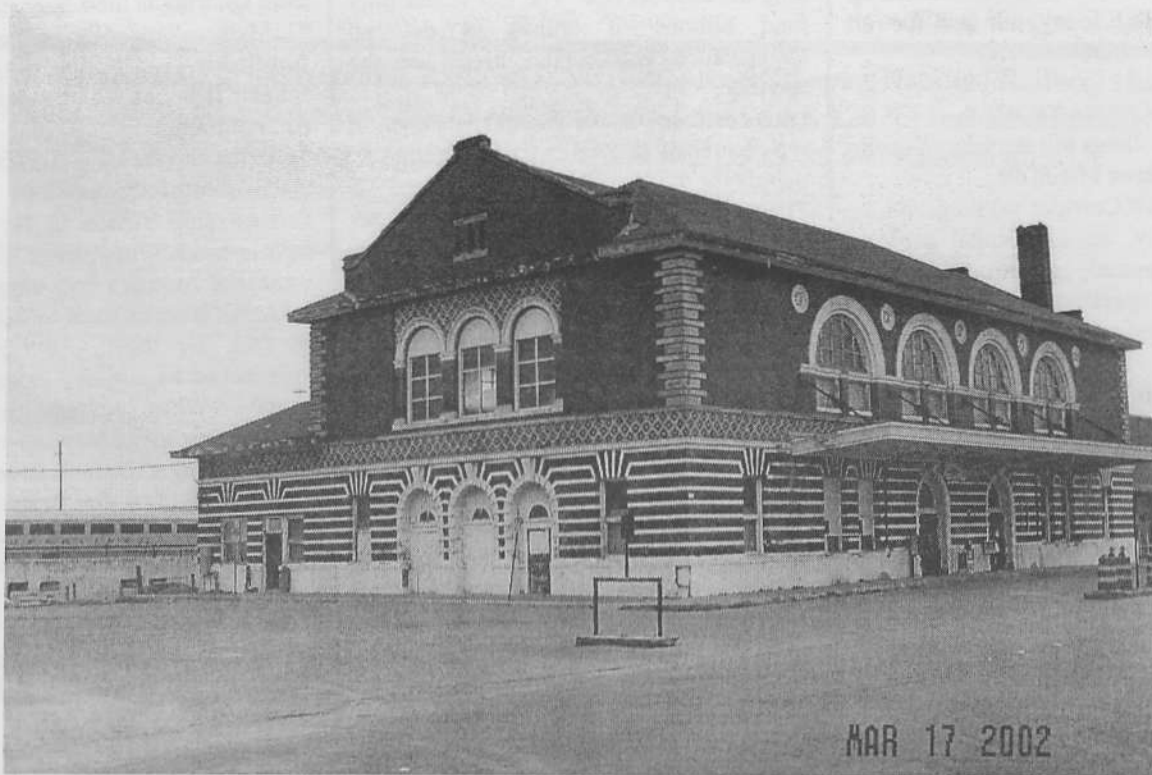
After 103 years of continuous service to passenger trains, the Fort Worth Santa Fe depot saw its last train February 26, 2002, as the Heartland Flyer left at 5:25 p.m. It opened in 1899. Amtrak now uses the new Intermodal Transportation Center a short walk north.