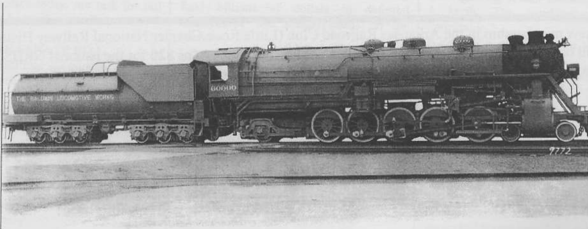
Experimental engine with a high-pressure third cylinder and a watertube firebox. No railroads wanted it because of high maintenance cost of the extra cylinder, and the watertube firebox. (Gene Hull collection)