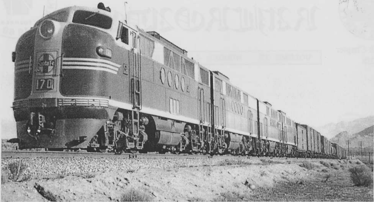
ATSF #170 near Cajon Pass, California in 1947.