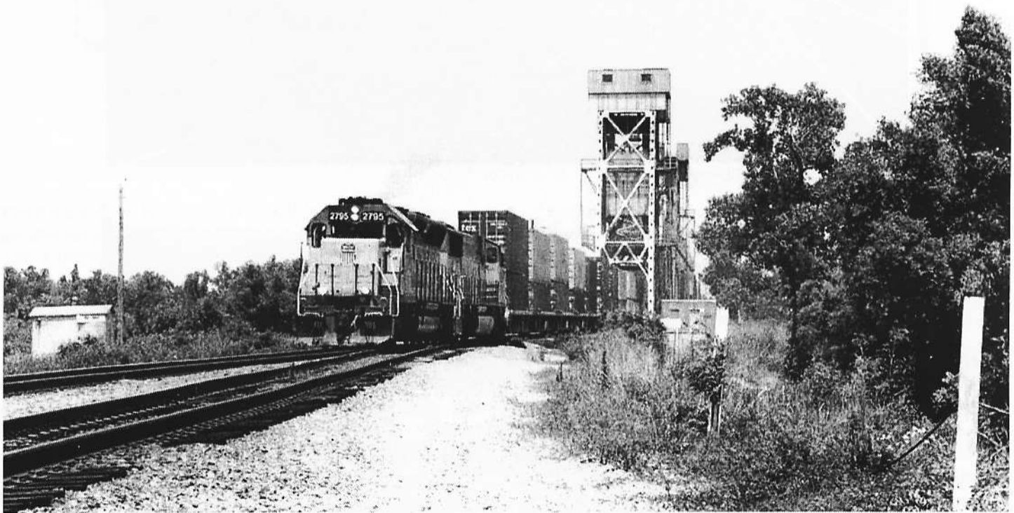
Union Pacific 2795 & UP 6134 on the IMNLBR 21 crossing the river at Pine Bluff, Arkansas, June 22, 2002.