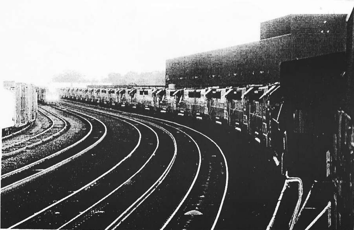
A Union Pacific power move taken at the North Little Rock yards, June 21, 2002. In the lead was UP9807 followed by CEFX7110 (powered units) followed by UP5996, 5966, 5994, 5998, 5964, 5965, 5958, 5990, CNW8052, UP5992, 5986, 5982, 5968, 5989, 5993, 5963, 5999, 5988, 5997, 2150, 2125, and 5987 (total of 24 locomotives - let's see, if two locomotives could pull 100 cars, then this train potentially could be 1,200 cars long!). The train was the ENLNP21, probably a move to return leased units UP no longer needed.