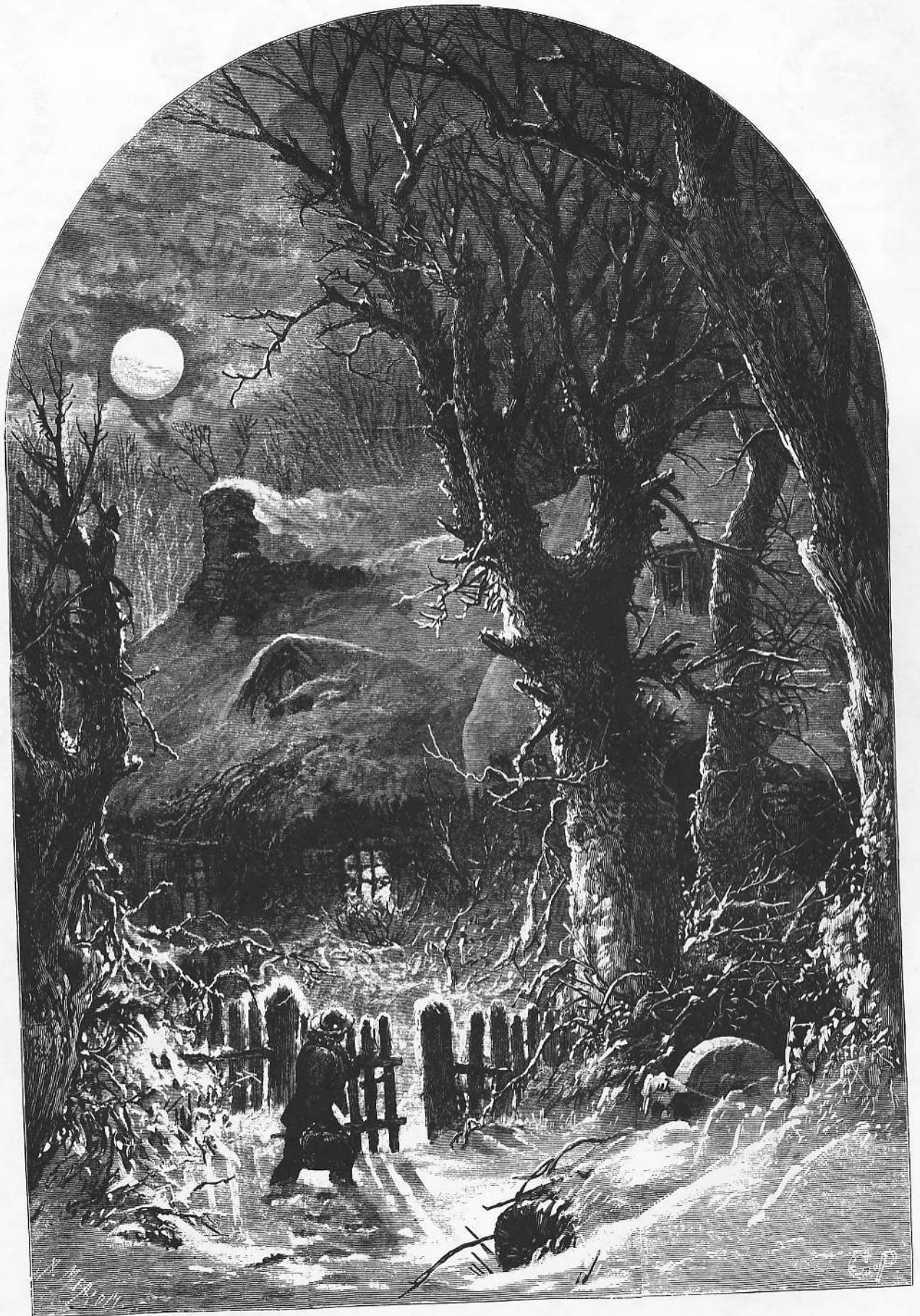
"The Old Homestead—Going Home for the Holidays," by Granville Perkins. From Harper's Weekly , Dec. 25, 1875.