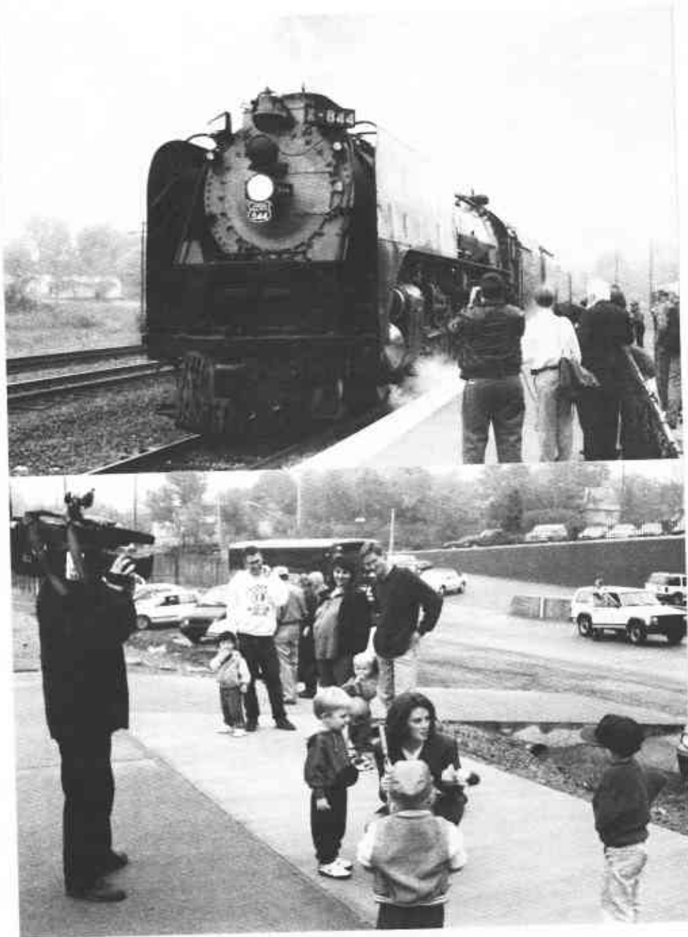
TOP - Our October Union Pacific excursion train coming into Little Rock, Friday October 25, 1996 behind the 844. Local talk show host Pat Lynch is seen standing next to the fence to the right. BOTTOM - A local television crew was waiting for the train, interviewing people.