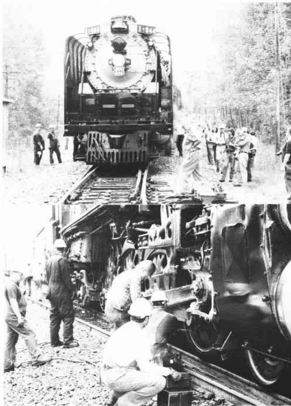
TOP - The 844 parked on the wye at Bald Knob, Sunday, October 27, 1996. It then backed northward onto the main line and headed south for Little Rock. A huge downpour and thundertorm occurred just after we returned to Little Rock that night. BOTTOM - Workers oiling and checking the engine at Bald Knob.