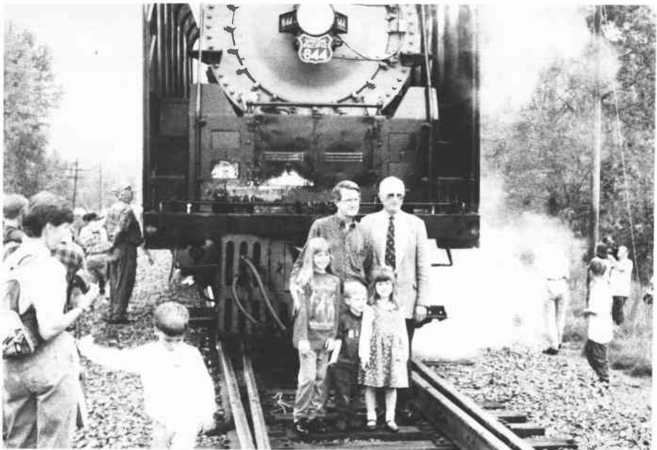
Unknown family posing in front of U.P.'s #844 while on the wye at Bald Knob, October 27, 1996.