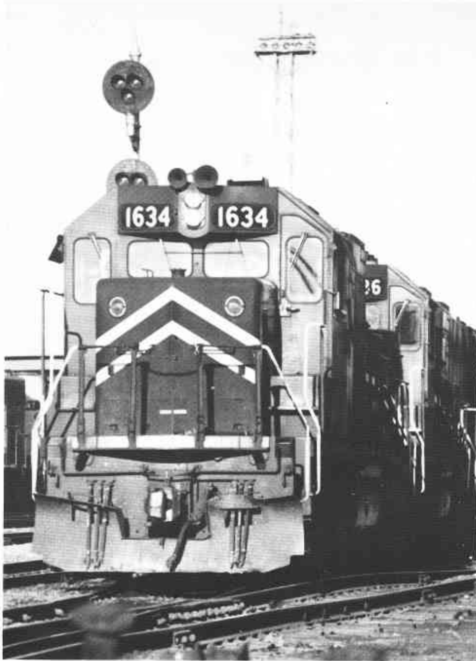
MISSOURI PACIFIC #1634 in the North Little Rock Yards in the early 1980's.