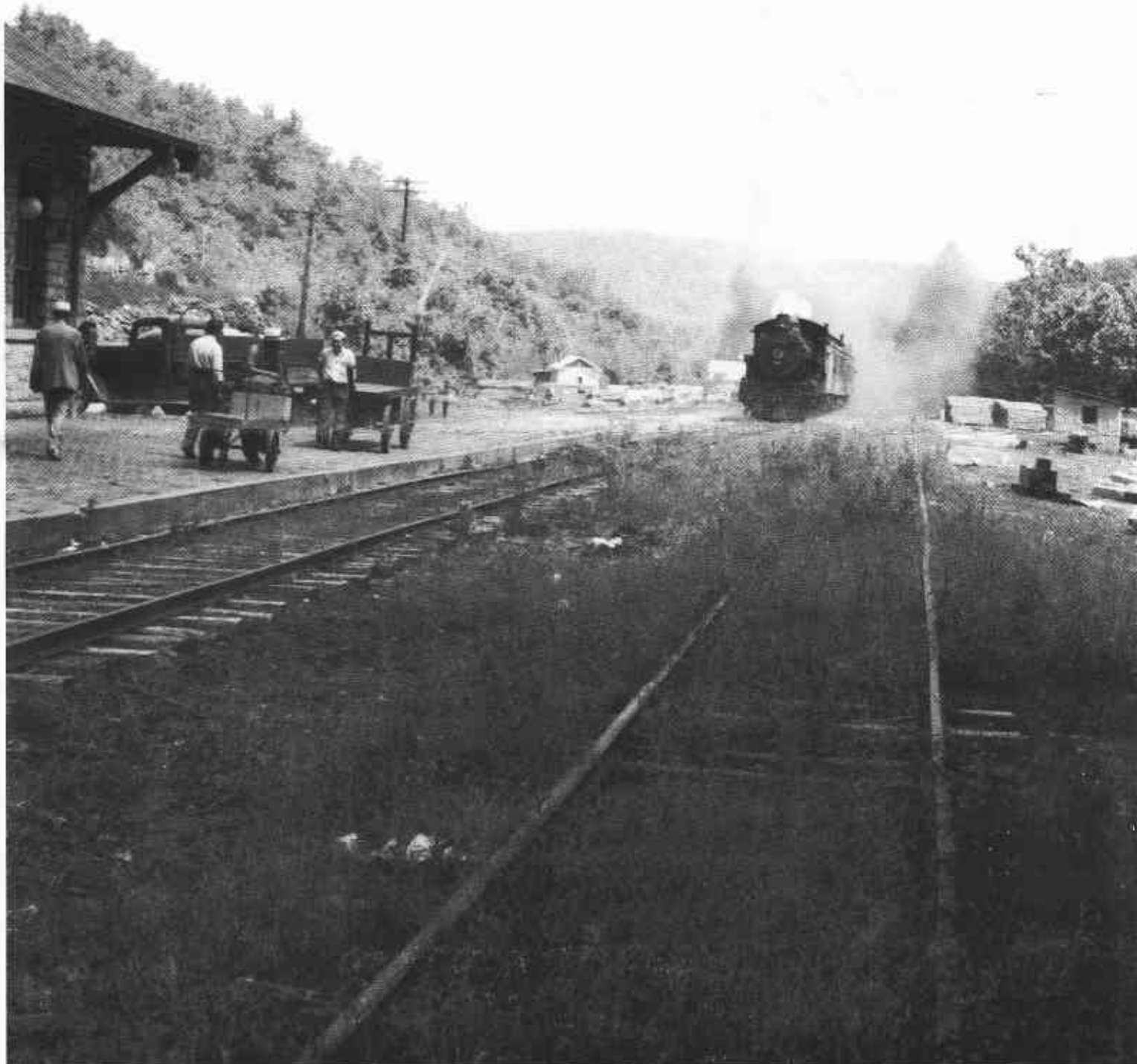
Missouri & North Arkansas Railroad's last steam run to Eureka Springs, Arkansas, September 6, 1946.