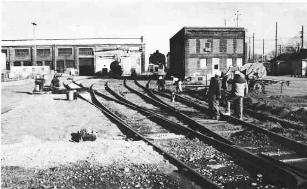
ARKANSAS RAILROAD MUSEUM track work was progressing nicely in December 1996. New track was being laid on the west side of the Pine Bluff museum (home of Cotton Belt #819) for displaying the museum's increasing collection of equipment.