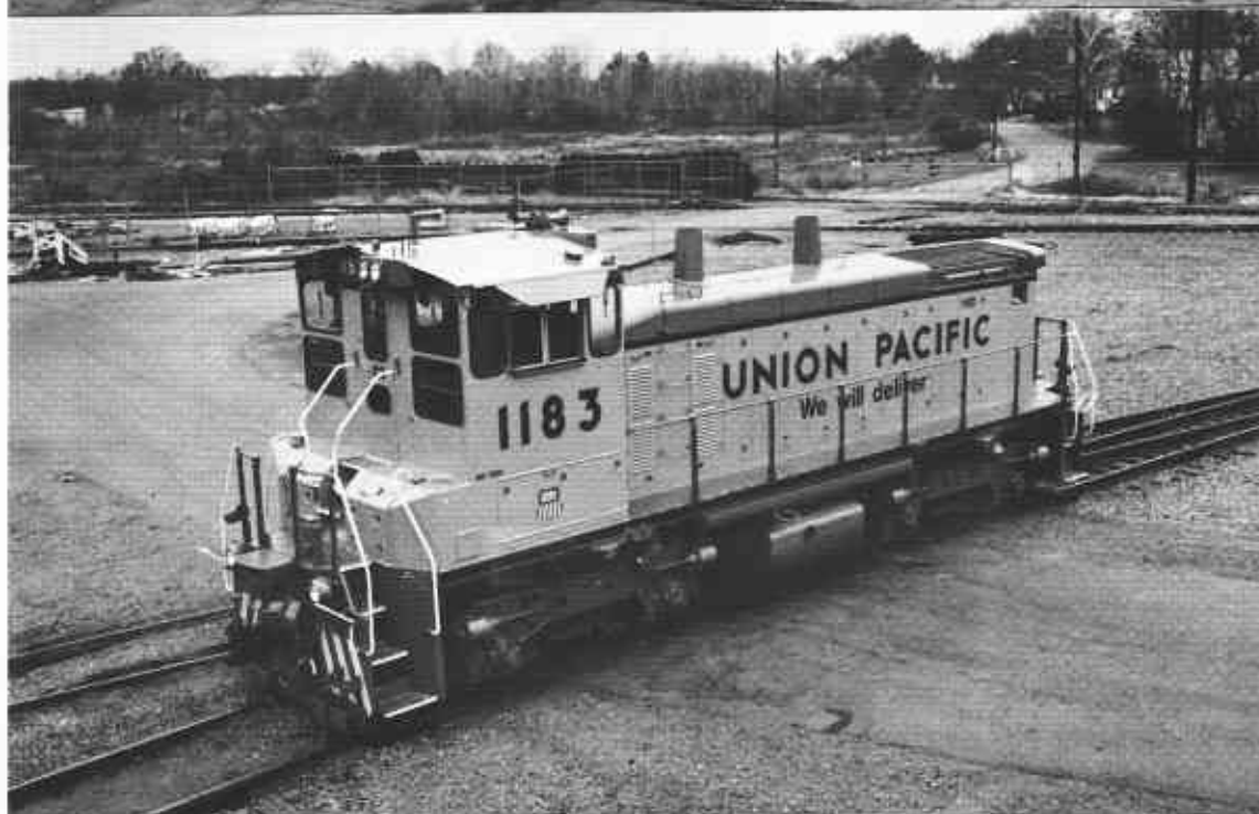
FIRST SP UNIT PAINTED IN UP COLORS (more on top of page 3 - John Jones photos, November-December 1996)