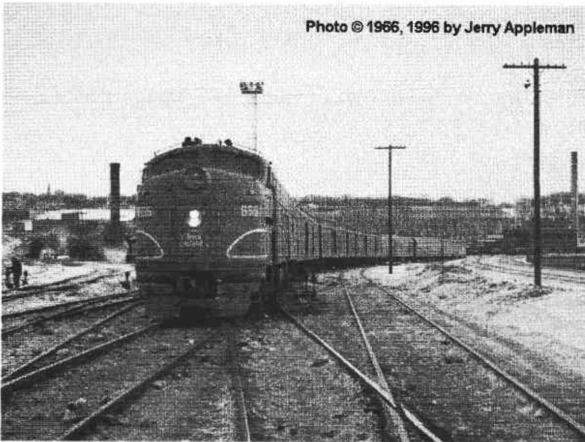
ROCK ISLAND 655 (E8A) on a passenger train at St. Paul, Minnesota in January 1965.