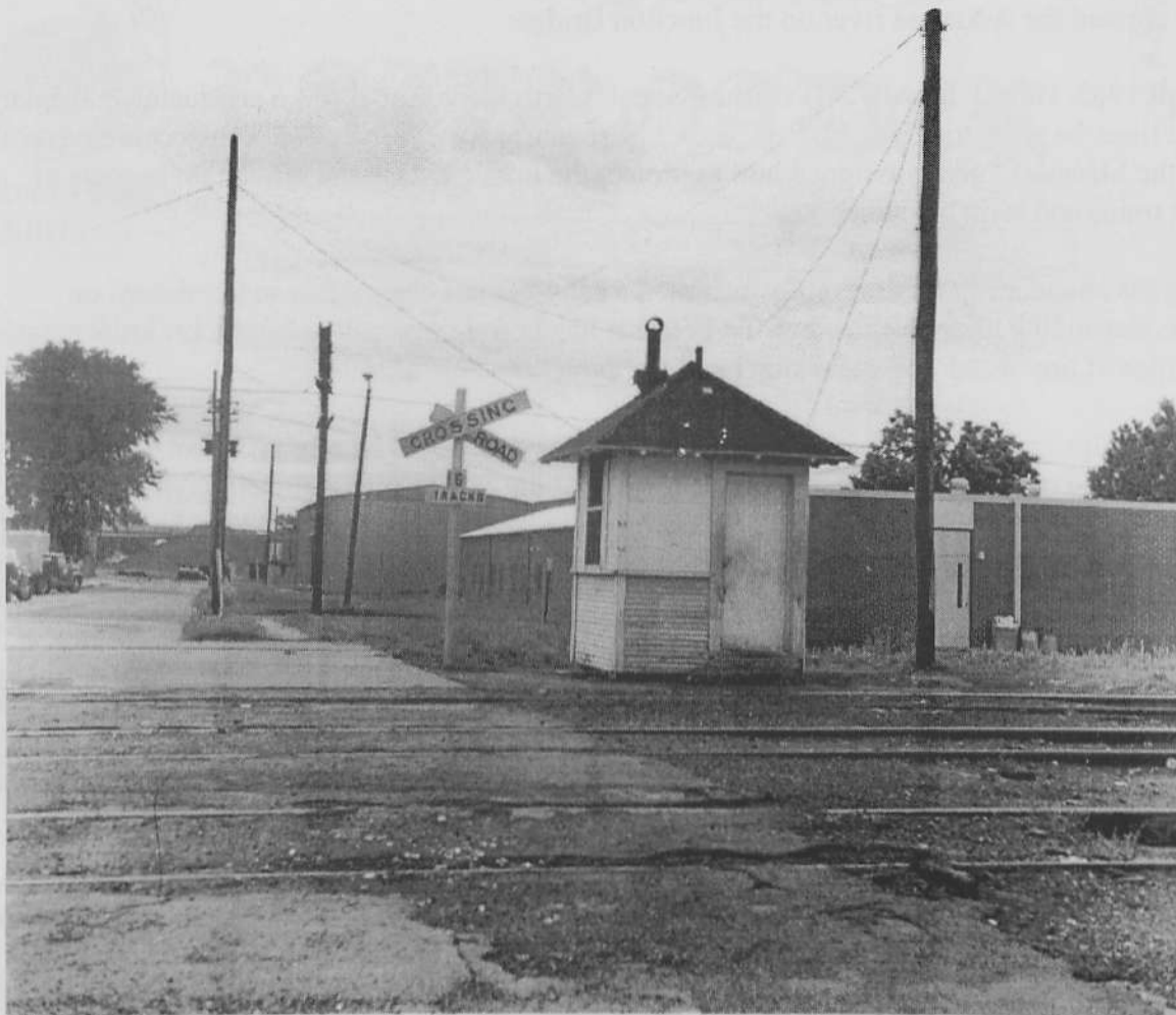
This crossing watchman's shanty sat at the southeast side of the intersection of East 4th Street and Missouri Pacific "Valley" Division main line at North Little Rock, Arkansas. Looking east. (Photo July 1967 by Gene Hull)