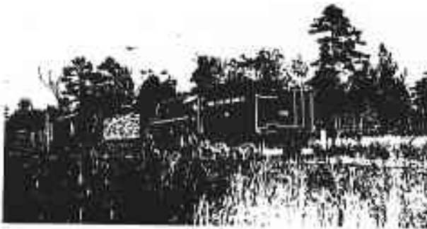
Warren & Saline River 2-6-4 No. 1781 backing on on 5-10-1968. Warren & Saline River, Arkansas on November 27, 1968. The little train will appear on Back Street tracks on the 12-13-1968. To Harrogate which is still in the hands of the Back Street and comes to Warren, 1/20-1968. 1/20-1968.

The Arkansas Railroad Club's 1998 calendar consists of 14 B&W photos of trains in Arkansas over the years - from modern locomotives to past steam. There's one photo for each month and a photo on both front and back.