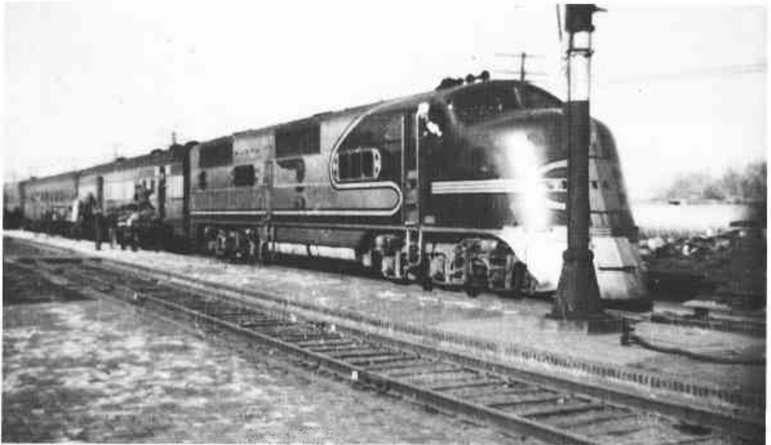
Santa Fe's Tulsan at Bartlesville, Oklahoma in 1941. The water spout was still being used by steam locomotives on the Oil Flyers and freight trains.