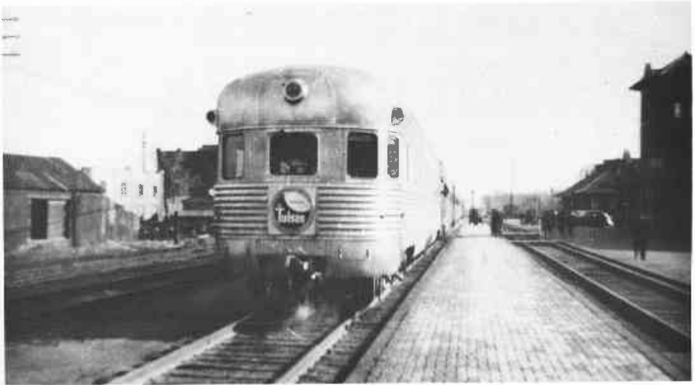
Santa Fe's Tulsan departing Bartlesville, Oklahoma for Kansas City, Missouri in 1941. This train was No. 212.