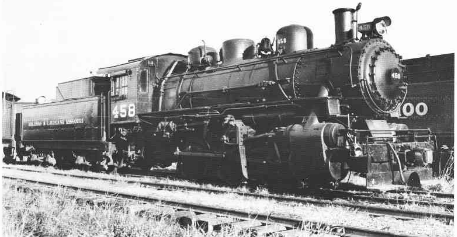
Arkansas & Louisiana Missouri 0-6-0 #458 in Monroe, Louisiana, November 1950.