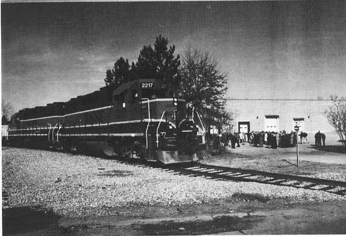
TOP - A Dallas Area Rapid Transit train is seen arriving at Dallas Union Station from the west and north while a Union Pacific freight heads to the west toward Fort Worth. BOTTOM - BNSF engines at a ribbon-cutting ceremony January 16, 1998 at the Port of Little Rock, beginning BNSF service to the area (in competition with Union Pacific), along with the Little Rock Port Railroad. Arkansas Governor Mike Huckabee (R) attended. BNSF now offers 6-day a week service out of Little Rock and can also connect to the Little Rock & Western.