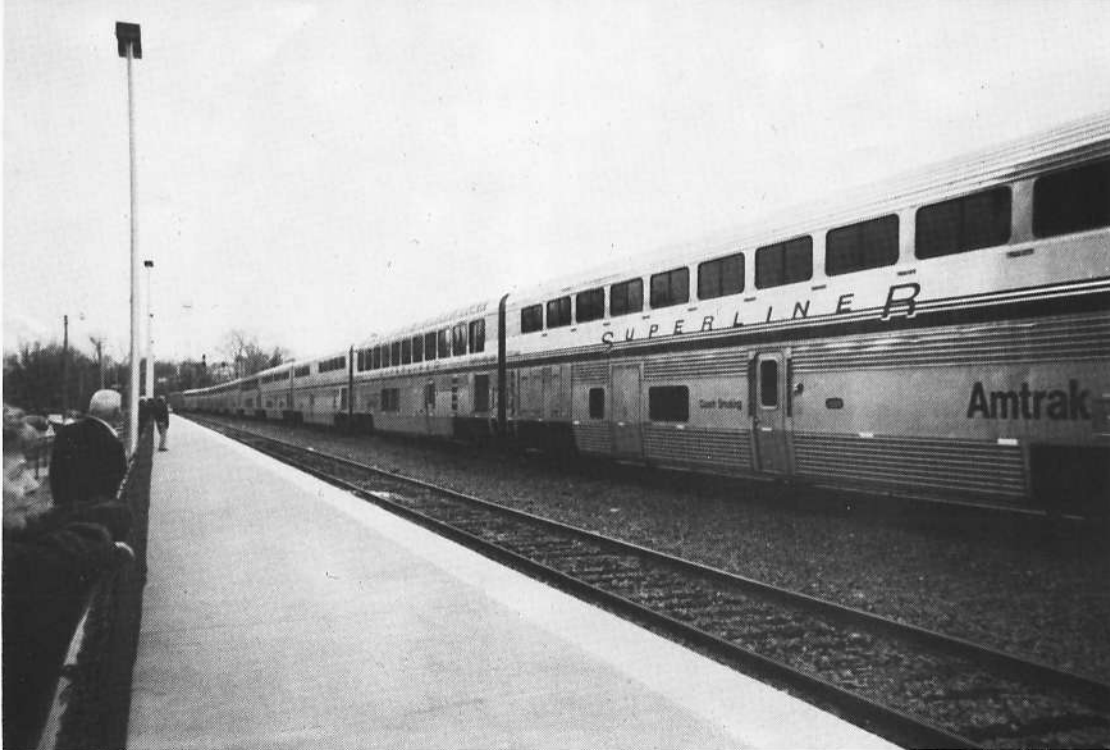
TOP - The first Amtrak southbound fourth Texas Eagle - California Service heading north through Little Rock on February 7, 1998. It had detoured through Pine Bluff around a coal train derailment and was 5½ hours late. It was turned on the wye in North Little Rock and headed back south about 1:30 p.m. BOTTOM - This was one of the longest Amtrak trains ever in Arkansas with 17 Superliner and other cars and 3 AMD-109 engines. Consist: 1215 (baggage), 39010, 32093 ("Missouri"), 32071 ("Arizona"), 32073 ("California"), coaches 34128, 34129, 33020 (lounge), 38065 (diner), 32072 ("Arkansas"), 33026 (lounge), 32111 ("Texas"), inaugural coaches 34061, 34010, 34032, 34131, express 71036. (John Jones consist)