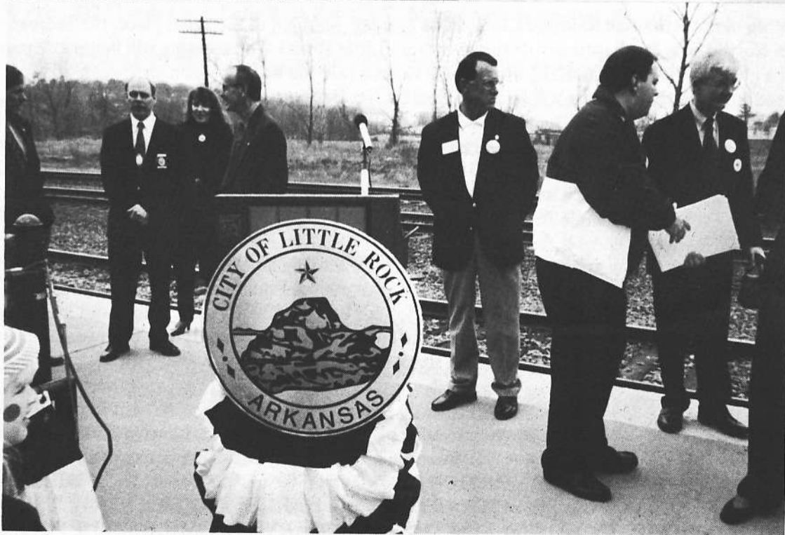
TOP - While heading north past the Little Rock station, the train stopped to unload several Amtrak dignitaries. BOTTOM - A special ceremony was held for the new fourth Texas Eagle all along the route, including Little Rock. This is the first time EVER that a through passenger train originated and terminated in Chicago and Los Angeles via San Antonio and Dallas-Fort Worth.