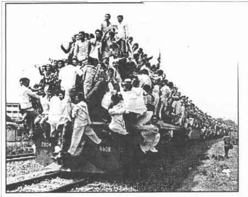
A dreamers concept of what our October excursions could look like, with everybody in the state trying to grab a train ride. (I don't quite think that the insurance company would like it too much, though).

CHATTANOOGA, TENNESSEE - Weekends much of year - sixteen trips scheduled by the Tennessee Valley Railroad, many into northwest Georgia on the Chattooga (not a misspelling) & Chickamauga Railway shortline - uses steam engines 610 and 4501 as well as diesel 1829 - these Dixie land Specials will be daylong, roundtrips and includes lunches - call 423-894-8028 or write TVRM, 4119 Cromwell Rd, Chattanooga TN 37421. AR