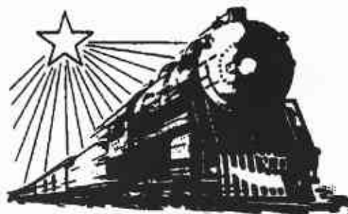
CBS "Grand Central Station" 1940's and 1950's

“As a bullet seeks its target, shining rails in every part of our great nation are aimed at Grand Central Station, heart of the country’s greatest city. Drawn by the magnetic force of the fantastic metropolis, day and night great trains rush toward the Hudson River...dive with a roar into the two-and-a-half mile tunnel beneath the swank and glitter of Park Avenue, and then-- Grand Central Station! -- Crossroads of a million private lives, gigantic stage on which are played a thousand dramas daily.”