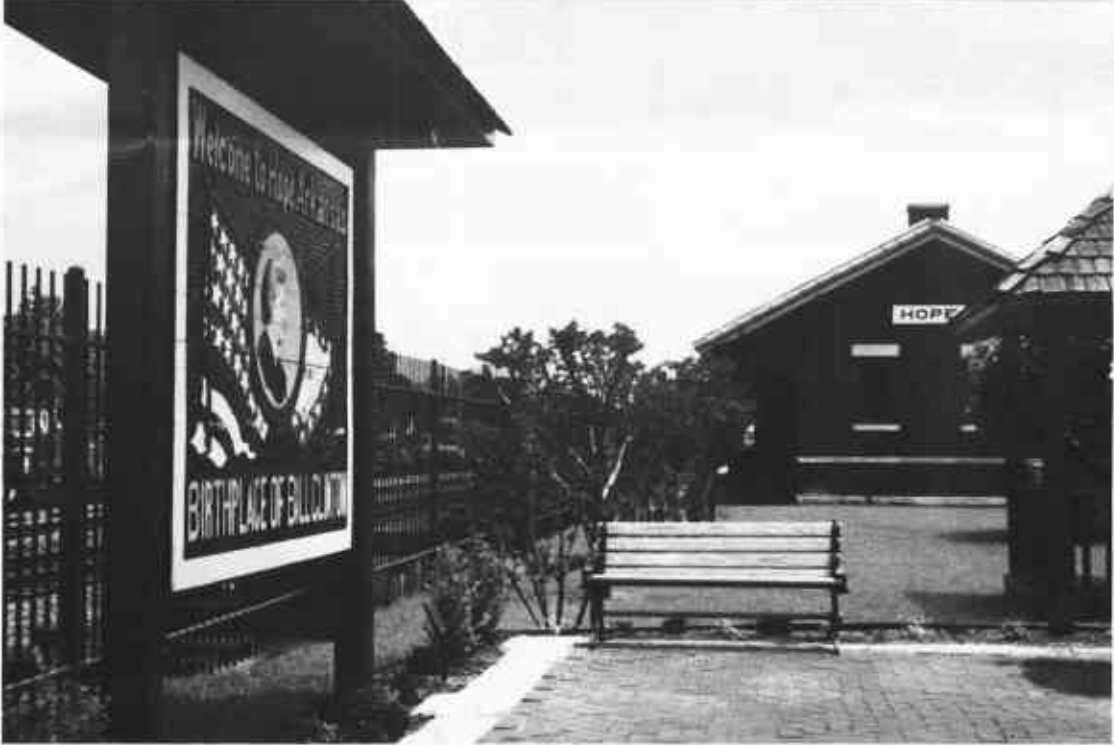
TOP - Amtrak's Texas Eagle at Little Rock's Union Station the morning of August 12, 1996. BOTTOM - The Missouri Pacific depot at Hope, Arkansas, the birthplace of President Bill Clinton, has been renovated and turned into a museum and visitor center (PO Box 596, Hope AR 71802). This is on Union Pacific's Arkansas-Texas main line, and the Texas Eagle runs by here each way three times a week.