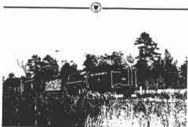
Warren & Saline River (W&SR) backing up the No. 1000 from Warren to (L) and (R) Arkansas on October 15, 1998. The W&SR train will operate on both sides of the river (L) and (R) W&SR No. 11 (L) and (R) will operate on the both sides and return to Warren, (R) to (L) when it goes to the railroad of (R) and (L).

The Arkansas Railroad Club's 1998 calendar consists of 14 B&W photos of trains in Arkansas over the years - from modern locomotives to past steam. There's one photo for each month and a photo on both front and back.