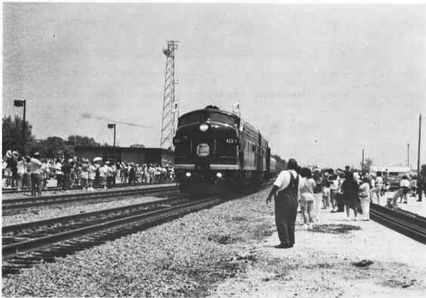
Arrival of the Kansas City Southern "Southern Belle" in Heavener, Oklahoma on July 4, 1996 with KCS-1 F-unit in the lead.