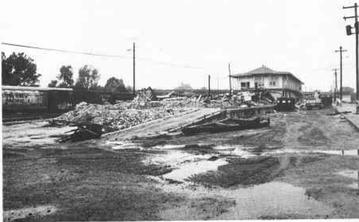
DEMOLITION DERBY - Before and after photos of a former Southern Pacific (Cotton Belt) maintenance shop in Pine Bluff, Arkansas. The old superintendent's office is in the background. The top photo was taken in July, 1997 - the bottom photo taken on August 8, 1997.