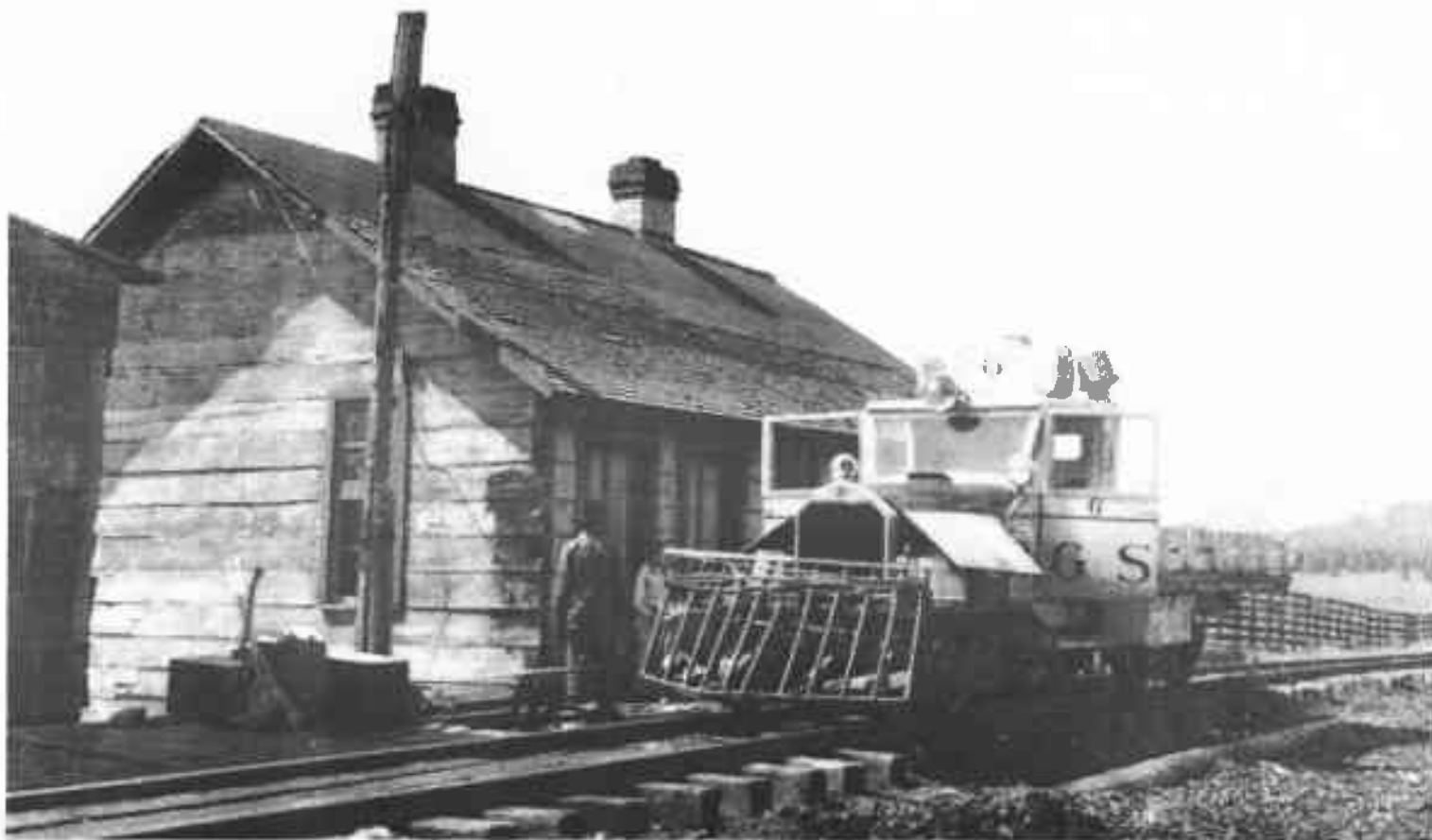
Rio Grande Southern Work Goose #6 at Ridgeway, Colorado, September 1950.