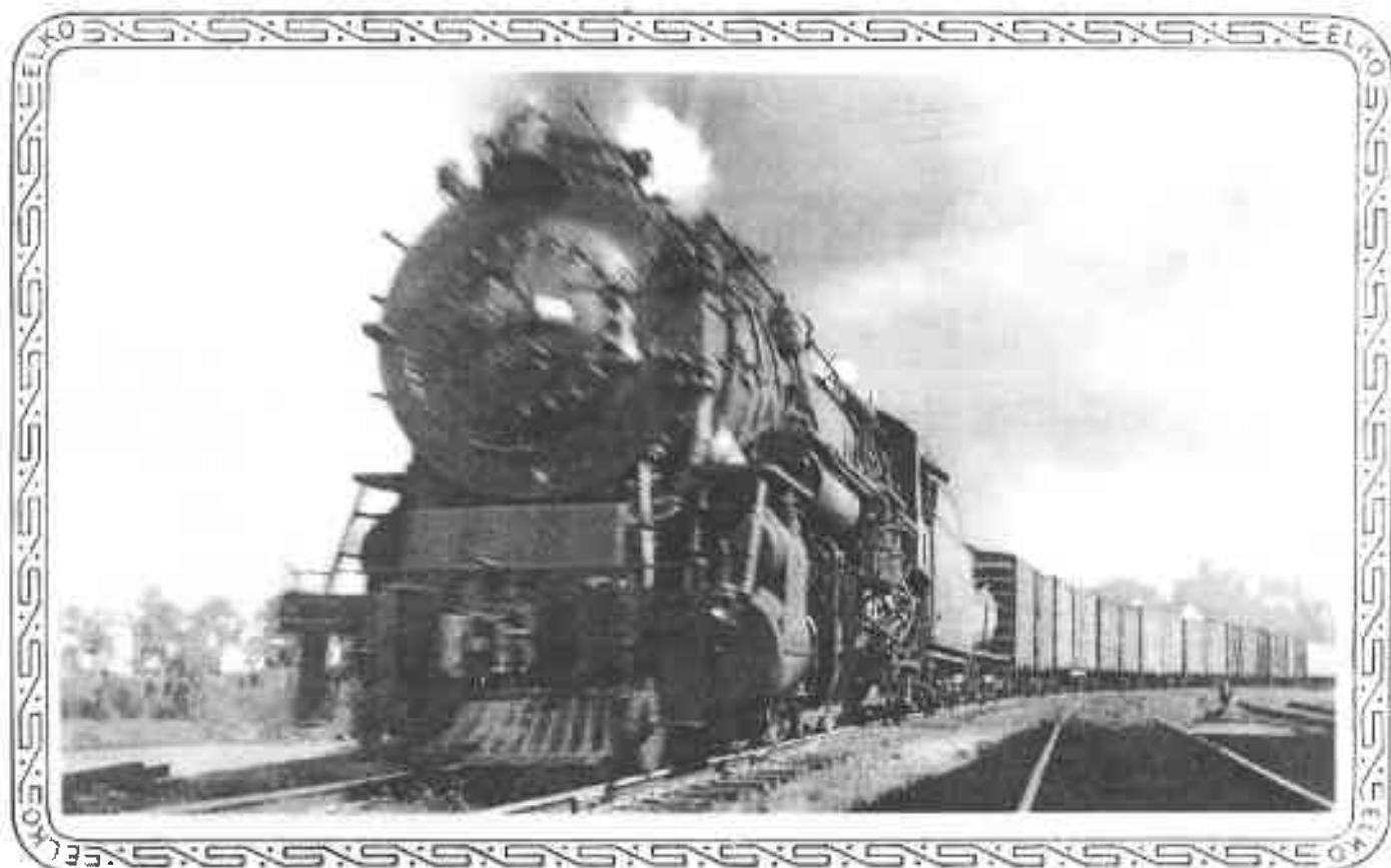
A "fat-boilered" Mike engine going by Little Rock Union Station on the freight main in October 1941. It was going about 40 mph and had engine 1489, a 2-8-2.