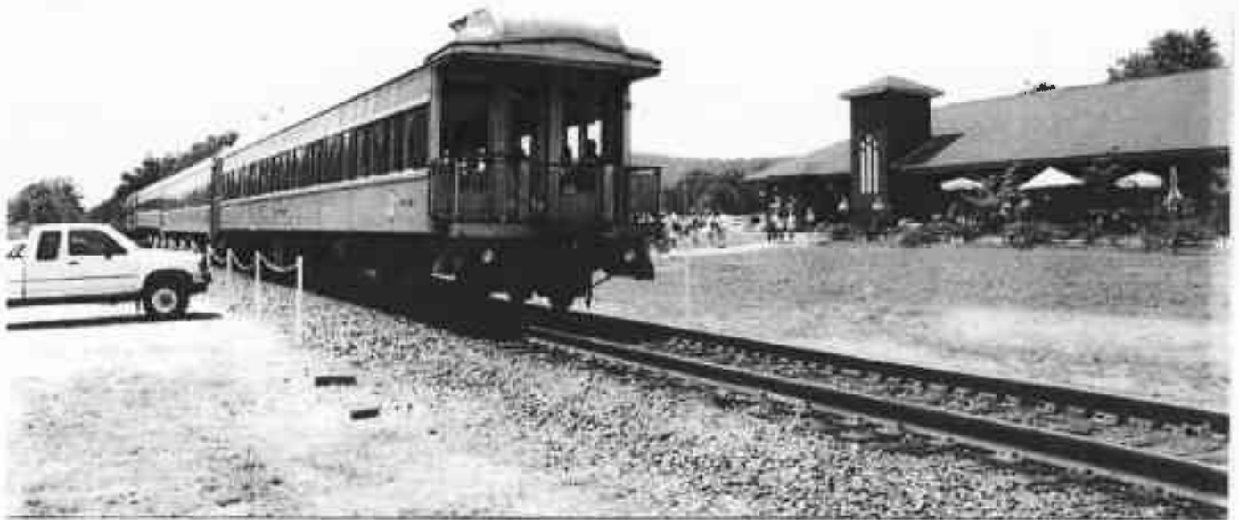
The White River Scenic Railroad's excursion train prepares to board passengers at Flippin, Arkansas in early August 1999. The boarding station is a drug store to the right. A fellow worker at my office tried to ride this train on a July weekday, but the train was full.