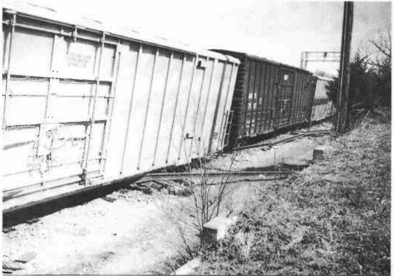
Some Amtrak Express cars jumped the track while leaving Little Rock's Union Station on #21, the Texas Eagle in July 1999.